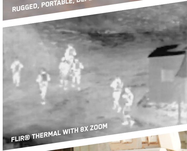
FLIR® THERMAL WITH 8X ZOOM