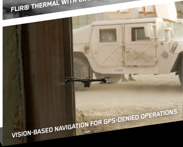
VISION-BASED NAVIGATION FOR GPS-DENIED OPERATIONS