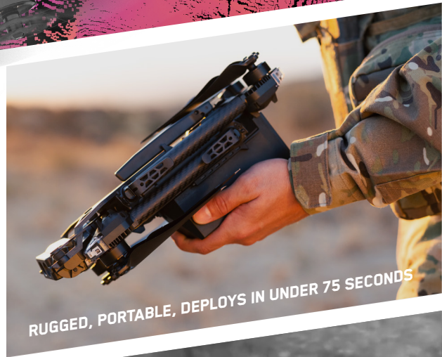
RUGGED, PORTABLE, DEPLOYS IN UNDER 75 SECONDS