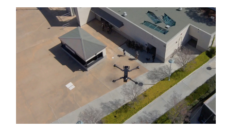
Go from box to flight in 90 seconds to get the intel you need.